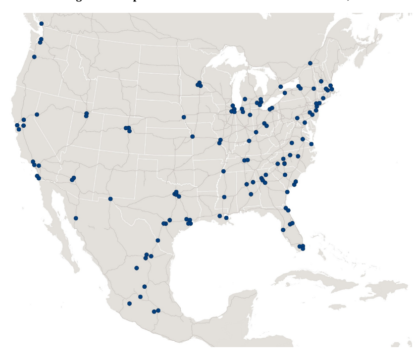
XPO Logistics Footprint in North America as of December 31, 2014